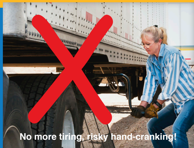
No more tiring, risky hand-cranking!