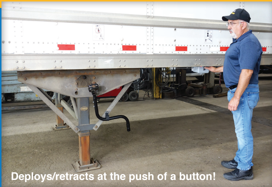
Deploys/retracts at the push of a button!